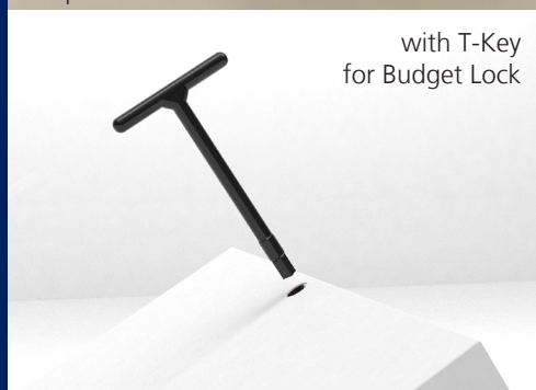
with T-Key for Budget Lock

Ceildoor's Essential range of access panels are cost-effective, with no compromise on quality.