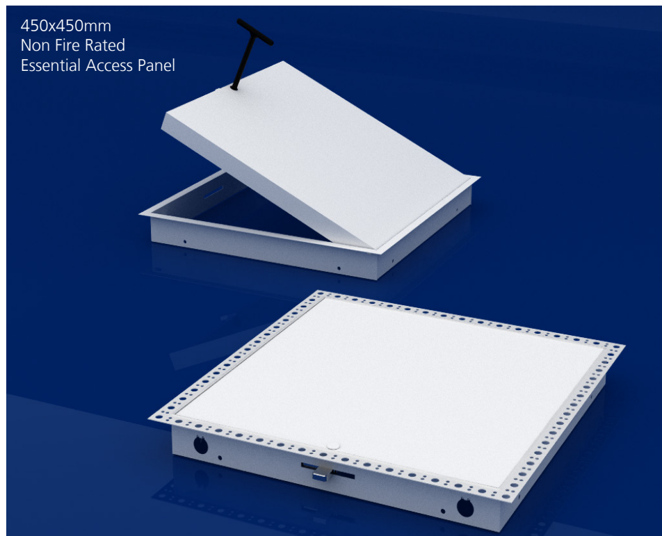
450x450mm Non Fire Rated Essential Access Panel