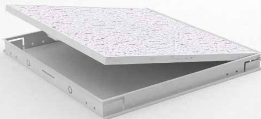
Flat Lay-In Exposed Grid Ceiling Access Panel

Tile to be supplied and fitted by installer, it is shown here for illustration purposes only.