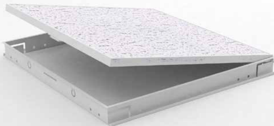
Tegular Exposed Grid Ceiling Access Panel

Tile to be supplied and fitted by installer, it is shown here for illustration purposes only.