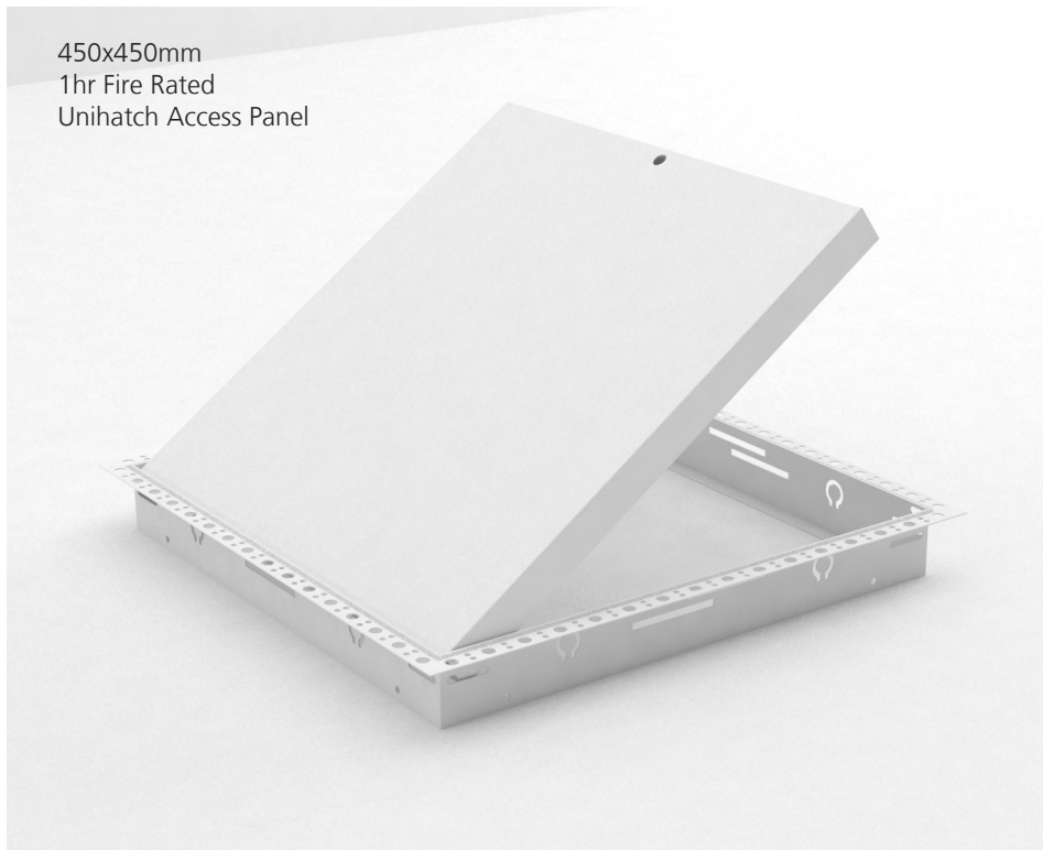
450x450mm 1hr Fire Rated Unihatch Access Panel