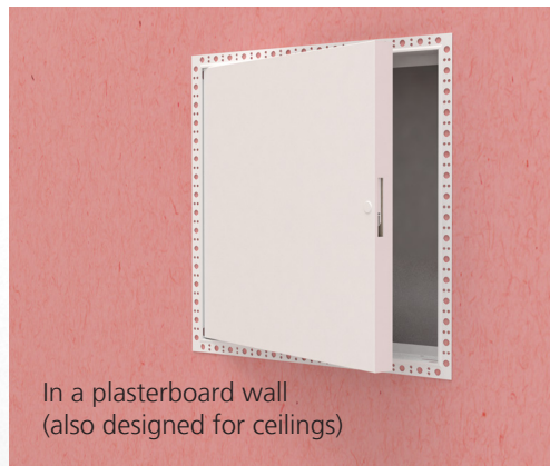
In a plasterboard wall (also designed for ceilings)