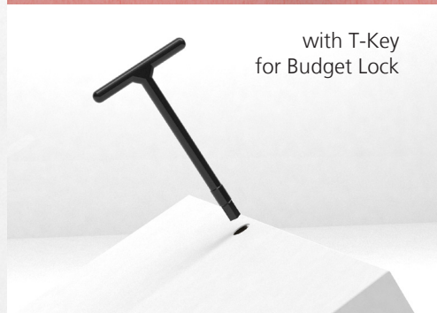
with T-Key for Budget Lock

Our 1 Hour Fire Rated access panels are designed for use in environments that need fire resistance. Independently tested by Exova Warringtonfire - for up to 60 minutes integrity performance.